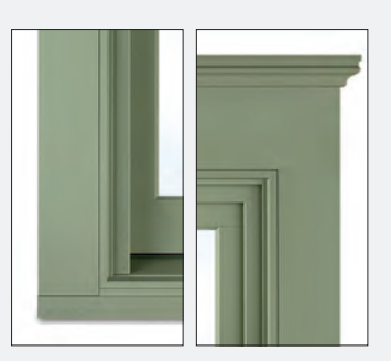
POTTER CASING WITH A217 SUBSILL