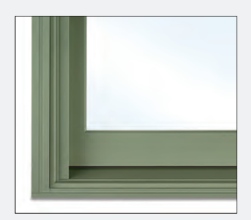
BRICK MOULD CASING WITH A246 SUBSILL

Adding Marvin<sup>®</sup> clad or wood casings and subsills to your windows and doors provides great architectural detail to any home. Our clad casings are made of ultra-durable extruded aluminum, which features a beautiful factory applied finish that resists chalking, fading, pitting, corrosion and marring. Casing profiles are consistent around a window or door, except for the Potter casing profile, which has a taller head. Custom casings and subsills are also available.