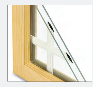
GRILLES-BETWEEN-THE-GLASS (GBG) Grilles are permanently installed between the glass panes. This low-maintenance grille is available with a two-tone option.

Separate panes of glass are glazed between muntin bars – the way windows have been made since the beginning. (Available for wood units only.)