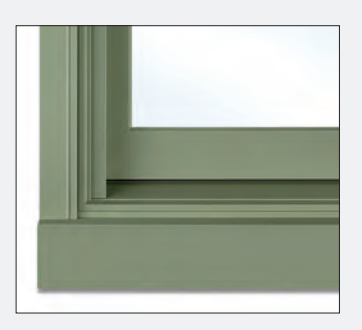
GRAYSON CASING WITH A1451 SUBSILL