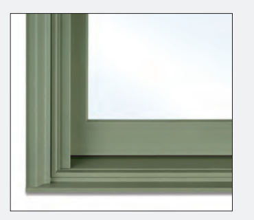
THORTON CASING WITH A1450 SUBSILL