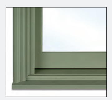
STRATTON CASING WITH A1453 SUBSILL