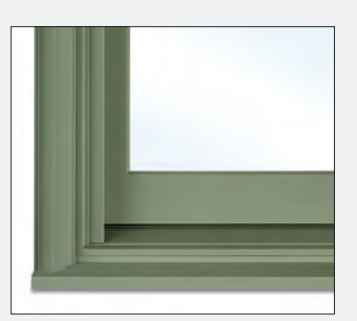
RIDGELAND CASING WITH A1453 SUBSILL