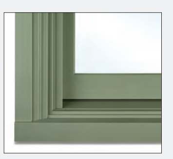
KINGSLEY CASING WITH A1452 SUBSILL