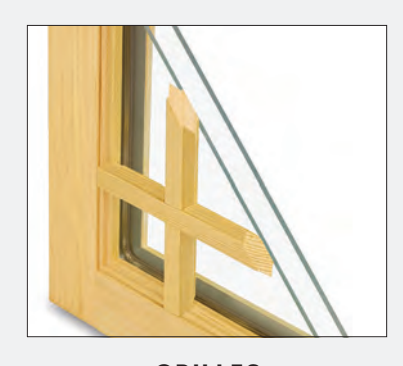
GRILLES Solid wood Grilles on the interior offer the look of classic divided lites, but can be easily removed for cleaning.