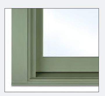
FLAT CASING WITH A246 SUBSILL