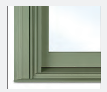
COLUMBUS CASING WITH A1450 SUBSILL